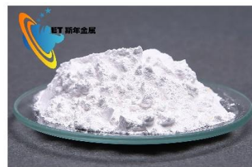
氧化钇 CAS NO.1314-36-9